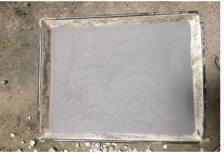
Fig. No. 3.1: Microsilica Supplied by walter pvt.ltd.

The microsilica used in the laboratory is complies with ASTM C1240 as shown in figure no.3.1 was obtained from Walter Pvt.Ltd. Mumbai.